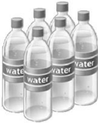
Pack of 6

Each student needs a bottle of water. How many of these packs are needed?