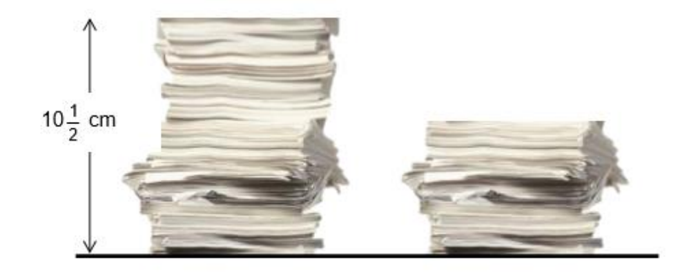
height of taller pile: height of shorter pile = 3:2 Work out the number of sheets of paper in the shorter pile.